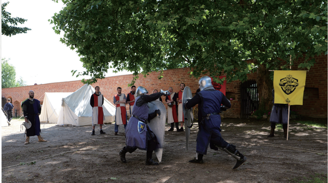
Player Interactive Events