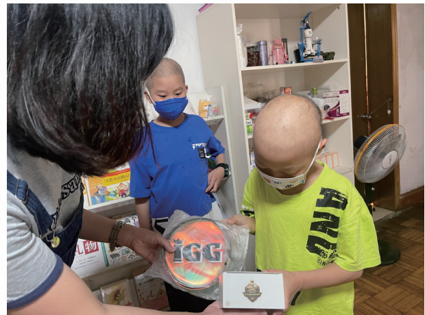
Visits for children battling illnesses