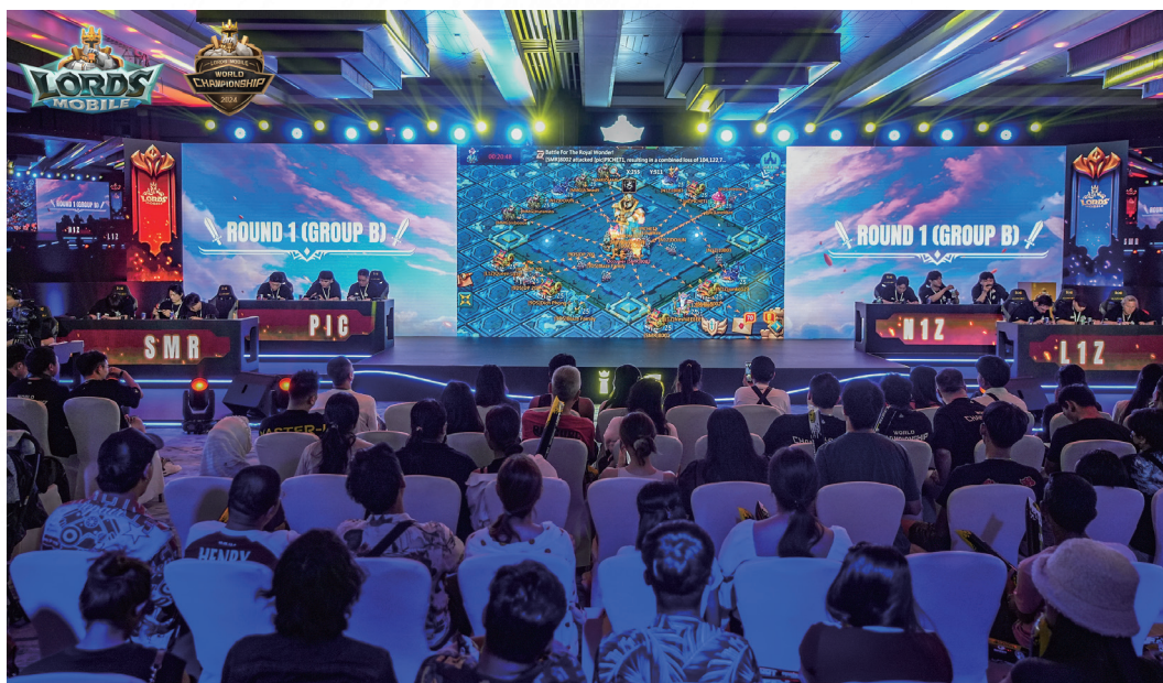
2024 World Championship

In 2024, we brought players a series of exciting interactive events. We hosted the world's first SLG international offline championship in Thailand, jointly launched by "Lords Mobile" and "Doomsday: Last Survivors". Besides, we held over ten offline esports competitions and player gatherings in locations such as Brazil, China, Spain, Turkey, Japan, and South Korea. In addition, major games roll out offline activities based on their unique themes. For example, "Lords Mobile" invited players to participate in the Tuscany Medieval Festival in Italy, allowing them to experience real-life scenes that recreated the game's medieval style.