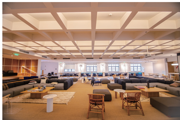
Comfortable Office Environment