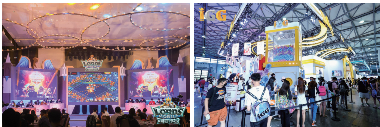
Player Interactive Events

IGG conducted offline activities for players in a variety of ways, including international game tournaments, player gatherings and attending major game shows. While expanding the influence of games, the events promoted close connection between players and IGG's games, and established exchange communities outside the cyberspace. In 2019, "Lords Mobile" organised offline gatherings in 15 regions across the world. The pandemic has not stopped us from bringing interactive events to players worldwide, and IGG took the show online in recent two years. Several interactive live streaming events were held, which have been well-received by players. During the challenging times of lockdown, our games kept gamers company by offering them high-quality entertainment. Through social media platforms or in-game messaging system, IGG and its games sent out reminders on precautionary measures, and called on gamers worldwide to help fight the pandemic, and stay fit and happy.