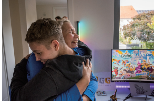
“Lords Mobile” granting wishes for children in need