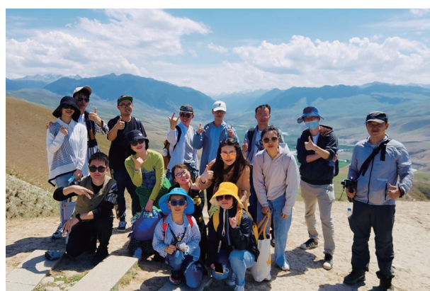
Staff Retreat and Holiday Events