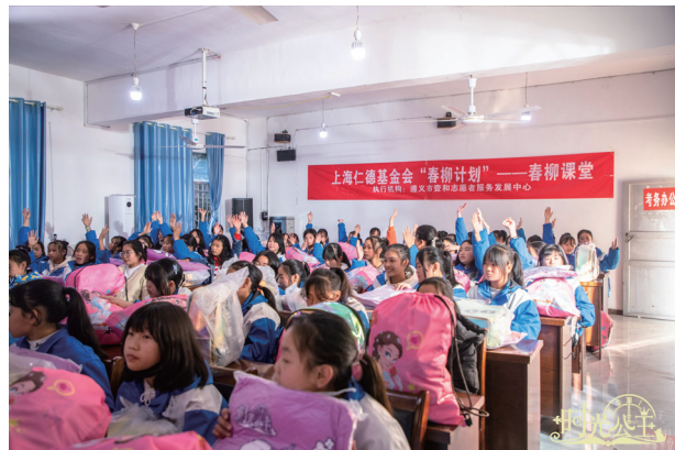
“Time Princess” empowering underprivileged girls